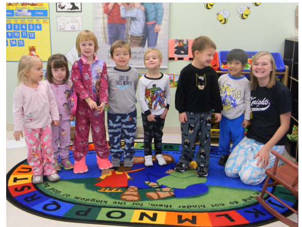
3's having fun on PJ Day