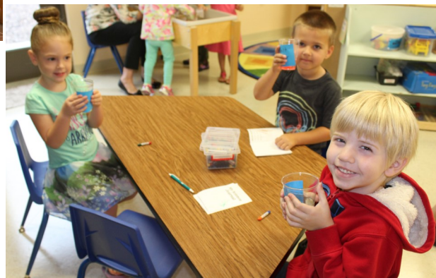
science experiment fun ►