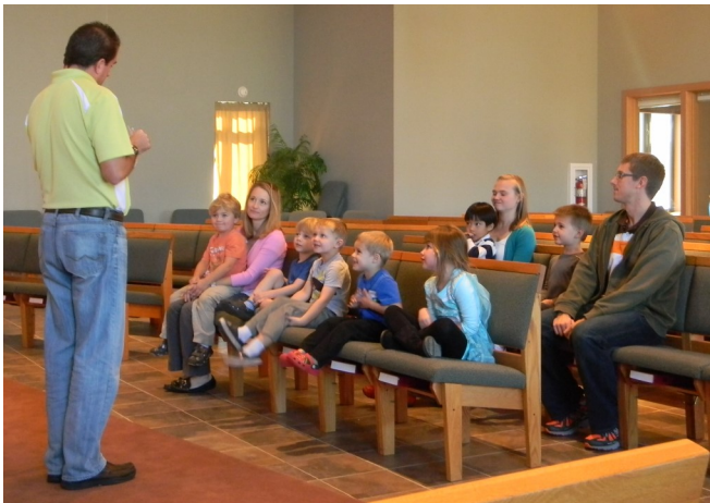
Chapel day with Pastor